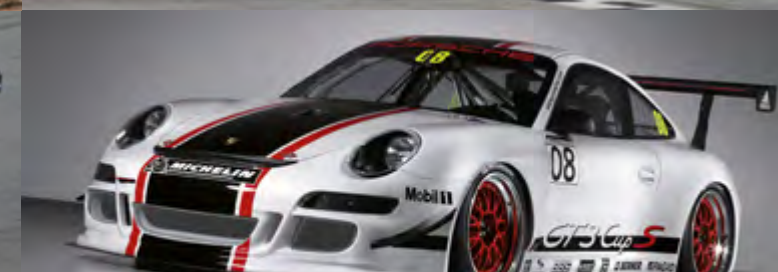
PORSCHE 997 GT3 CUP & CUP S