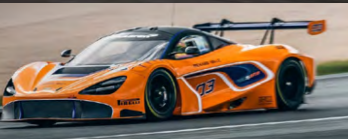
MCLAREN 720 S GT3