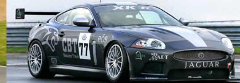
JAGUAR APEX XKR