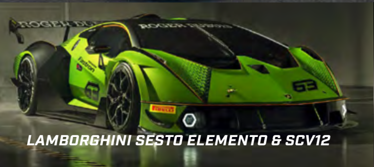
LAMBORGHINI SESTO ELEMENTO & SCV12