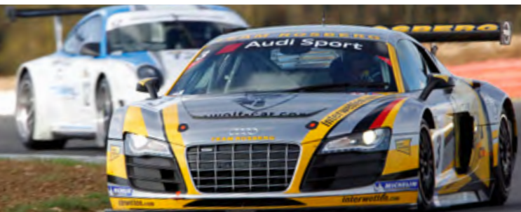
AUDI R8 LMS ULTRA

Cars of the previous generation of GT3 cars or those no longer under homologation will be accepted as long as they are in conformity with art 277 of Appendix J to ISC