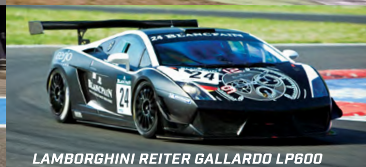
LAMBORGHINI REITER GALLARDO LP600