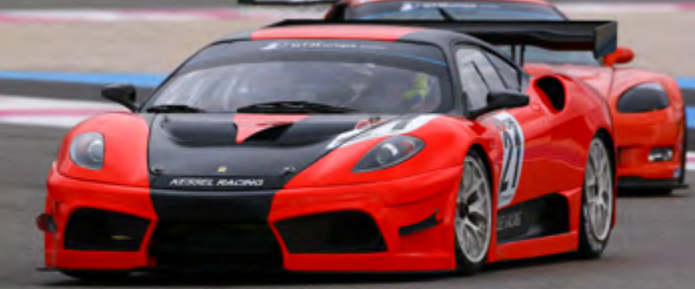
FERRARI KESSEL 430 SCUDERIA