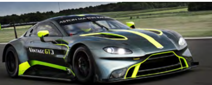
ASTON MARTIN VANTAGE GT3