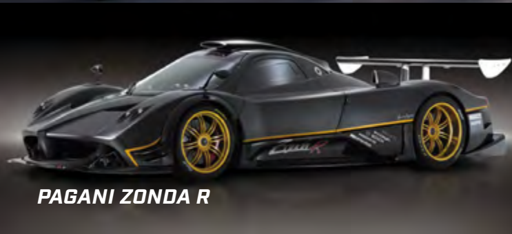
PAGANI ZONDA R