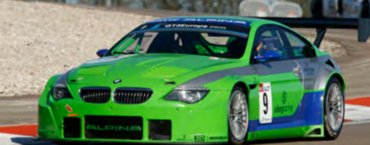
ALPINA B6 GT3