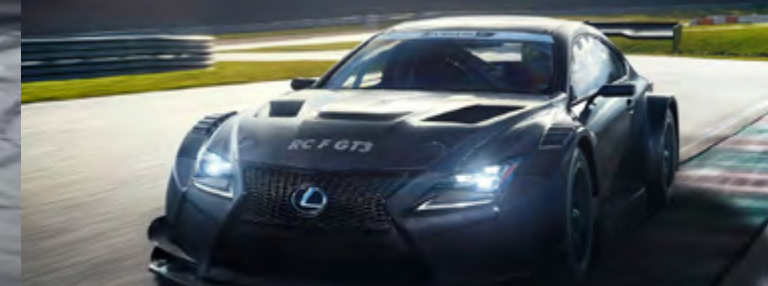
LEXUS RCF GT3