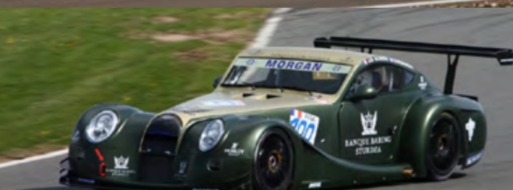
MORGAN AERO 8 GT3