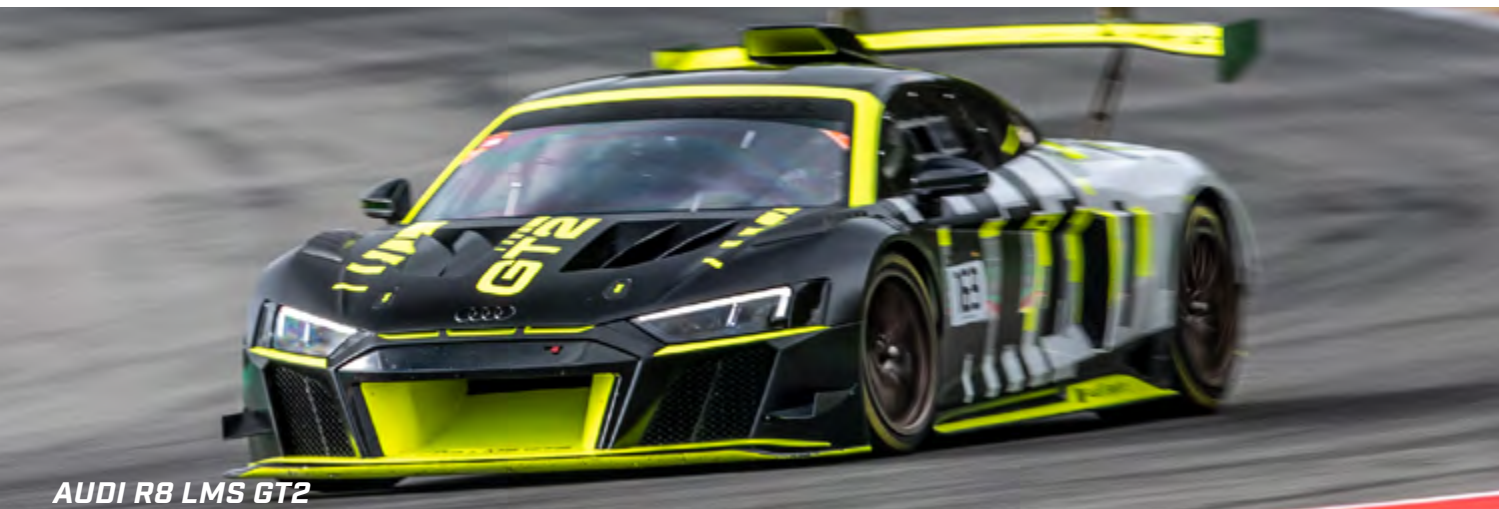
AUDI R8 LMS GT2