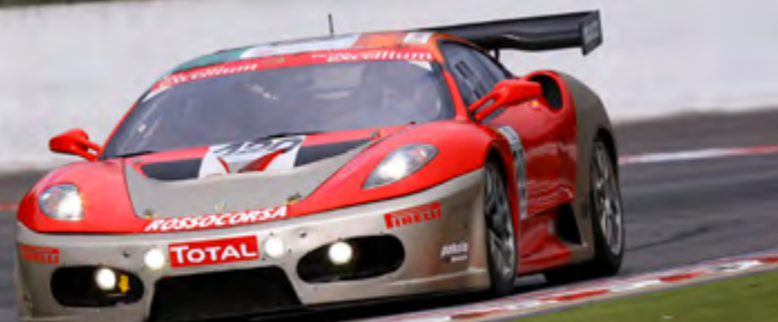
FERRARI KESSEL 430 GT3