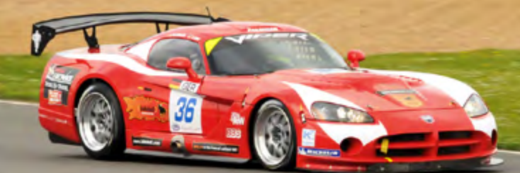
DODGE VIPER CC