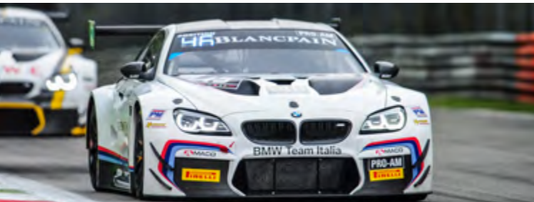
BMW M6 GT3