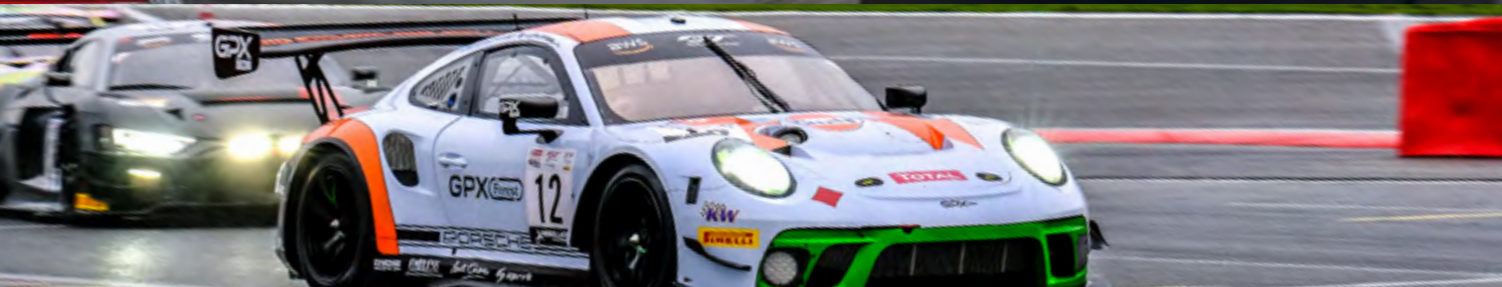
PORSCHE 911 GT3 R