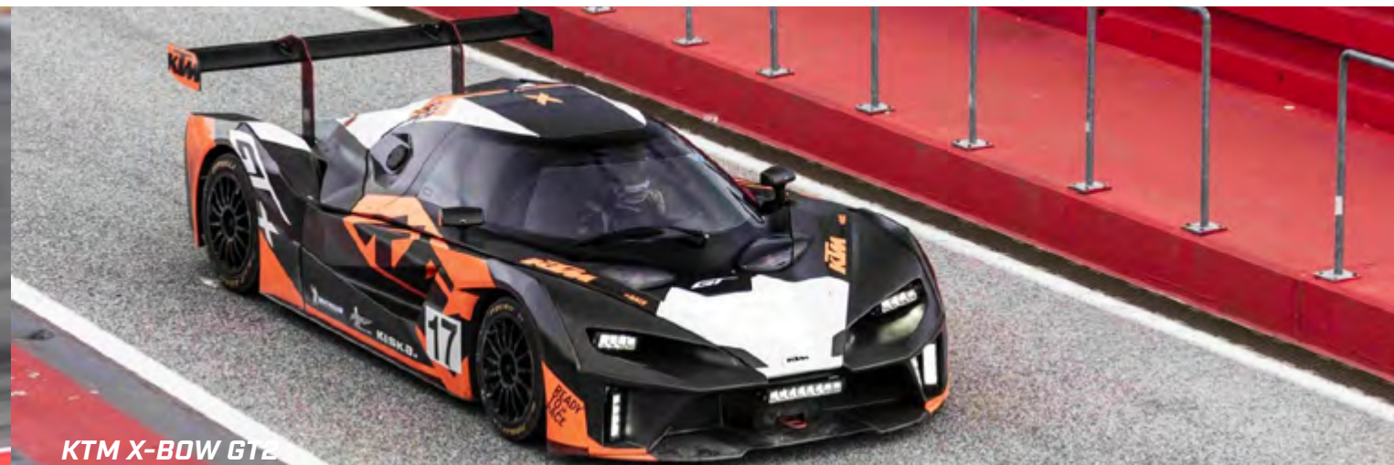
KTM X-BOW GT2