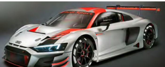
AUDI R8 LMS 2019