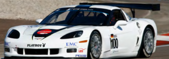
CORVETTE CALLAWAY Z06R