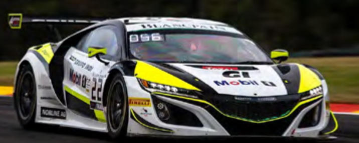
HONDA NSX GT3 2019