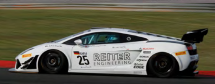
LAMBORGHINI REITER GALLARDO