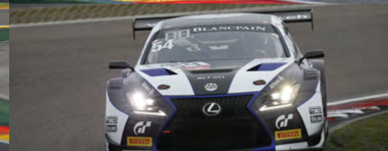
LEXUS RCF GT3