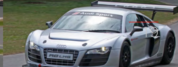
AUDI R8 LMS