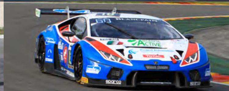
LAMBORGHINI HURACAN GT3