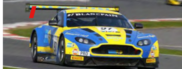
ASTON MARTIN VANTAGE V12 GT3