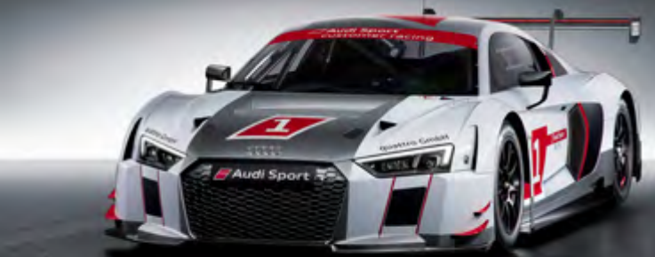
AUDI R8 LMS