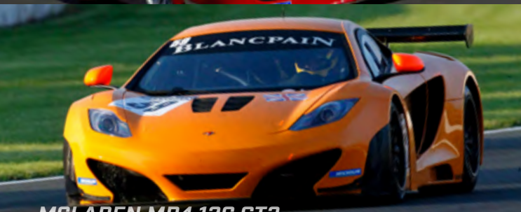
MCLAREN MP4 12C GT3