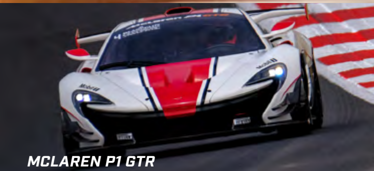
MCLAREN P1 GTR