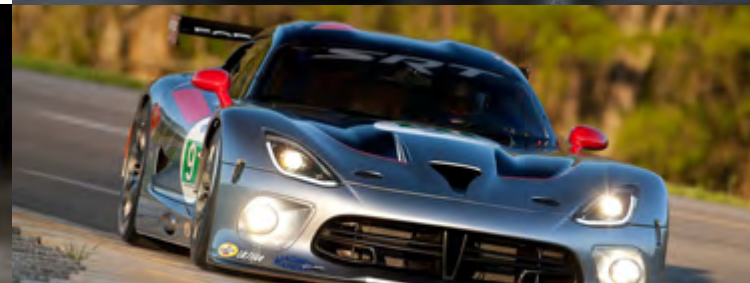
SRT VIPER GT3-R