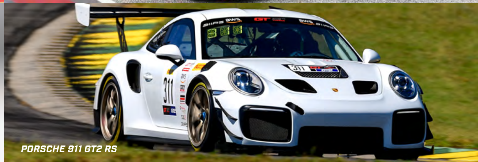
PORSCHE 911 GT2 RS