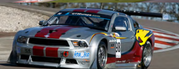
FORD MUSTANG MULTIMATIC VDS