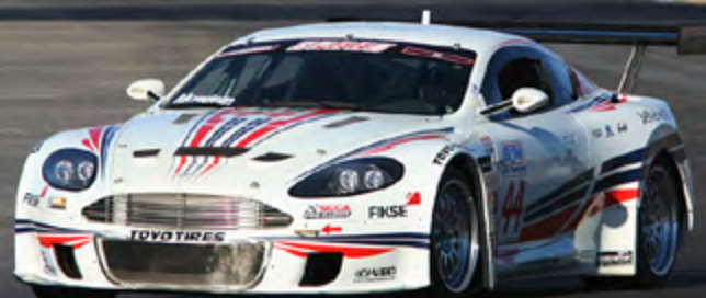
ASTON MARTIN DBR9