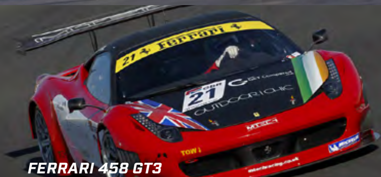
FERRARI 458 GT3