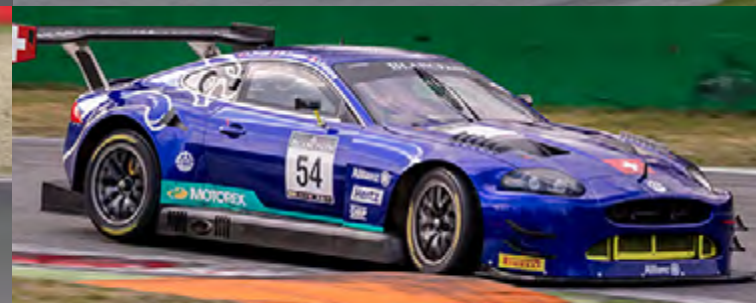
JAGUAR EMIL FREY XK GT3