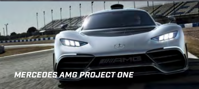
MERCEDES AMG PROJECT ONE