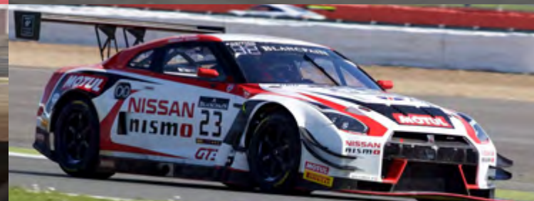
NISSAN GTR NISMO GT3