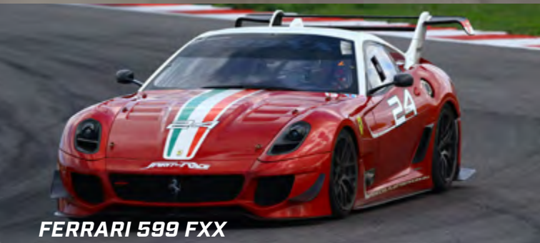
FERRARI 599 FXX