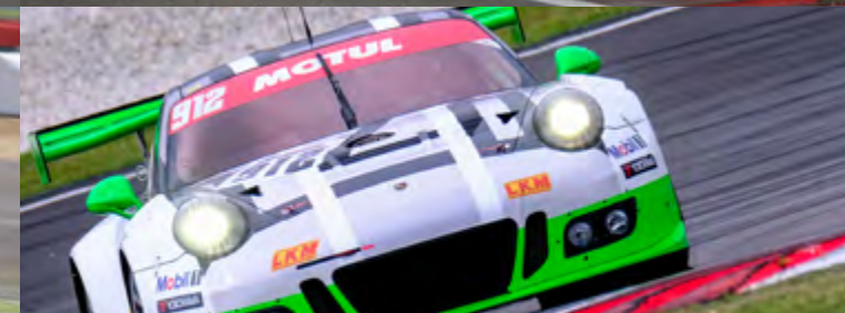
PORSCHE 911 GT3 R