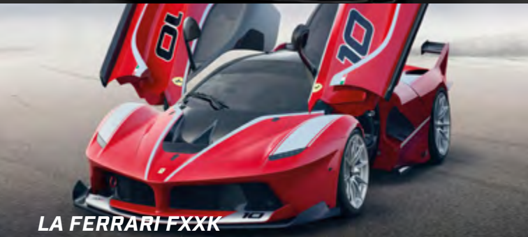
LA FERRARI FXXK