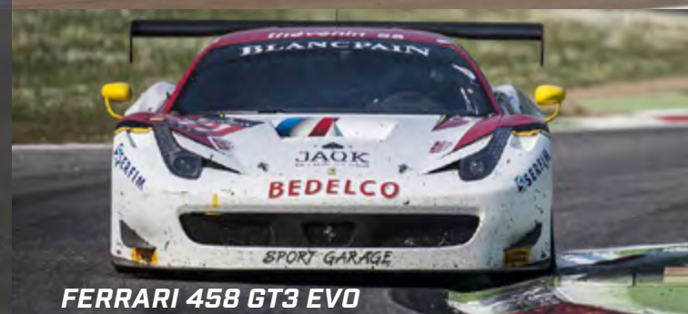
FERRARI 458 GT3 EVO