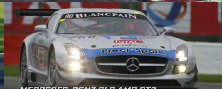
MERCEDES-BENZ SLS AMG GT3