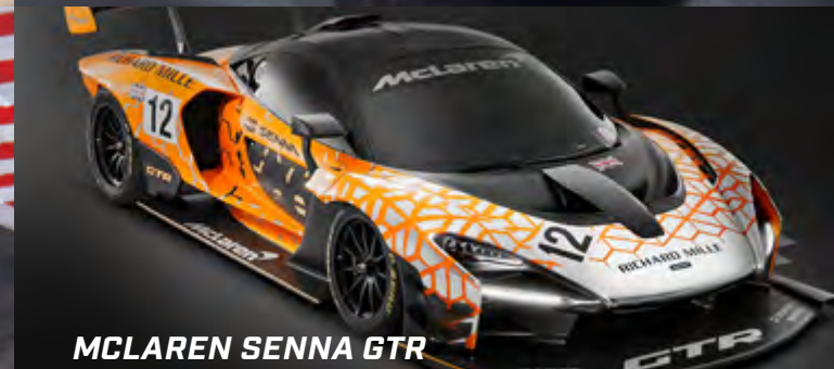
MCLAREN SENNA GTR