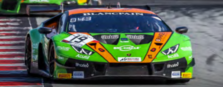
LAMBORGHINI HURACAN GT3 2019