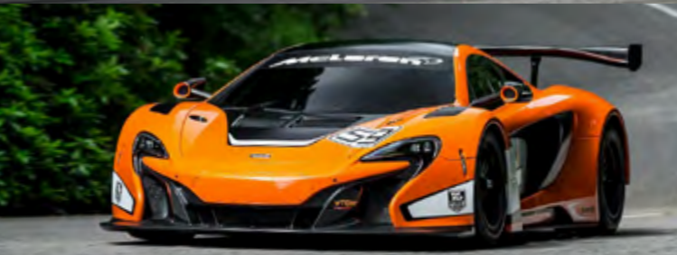
MCLAREN 650 S GT3