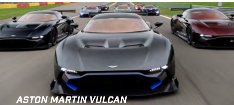
ASTON MARTIN VULCAN