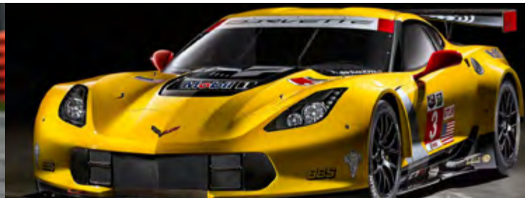
CORVETTE C7 GT3 R