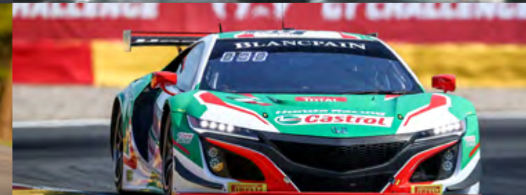
HONDA NSX GT3