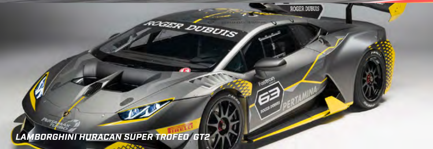
LAMBORGHINI HURACÁN SUPER TROFEO GT2