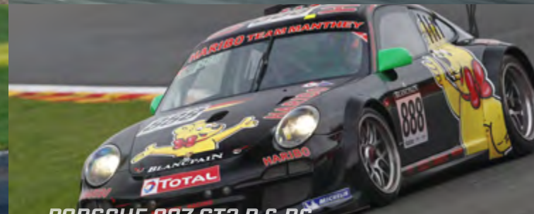
PORSCHE 997 GT3 R & RS