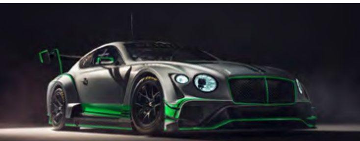
BENTLEY CONTINENTAL GT3 2018