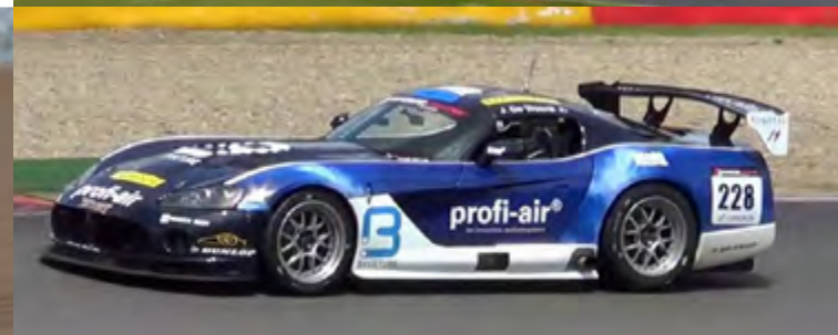
DODGE VIPER CC2