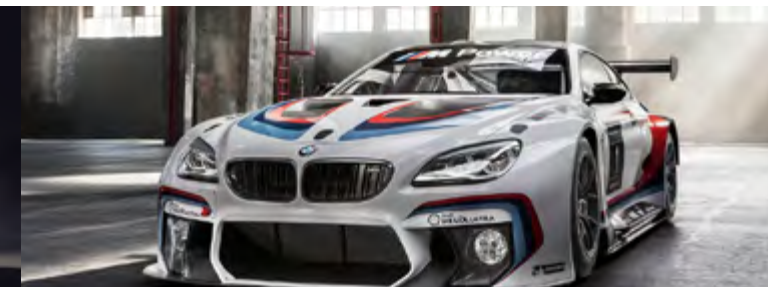
BMW M6 GT3 2018