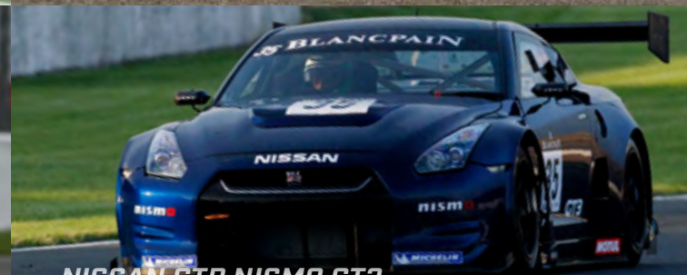
NISSAN GTR NISMO GT3