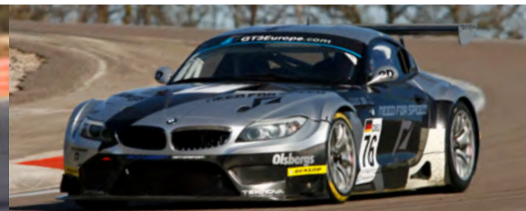
BMW Z4 GT3