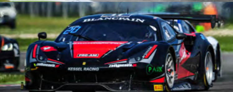
FERRARI 488 GT3