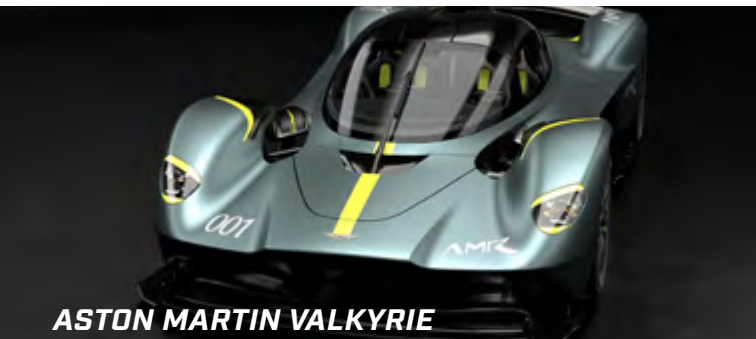
ASTON MARTIN VALKYRIE