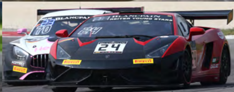
REITER GALLARDO R-EX