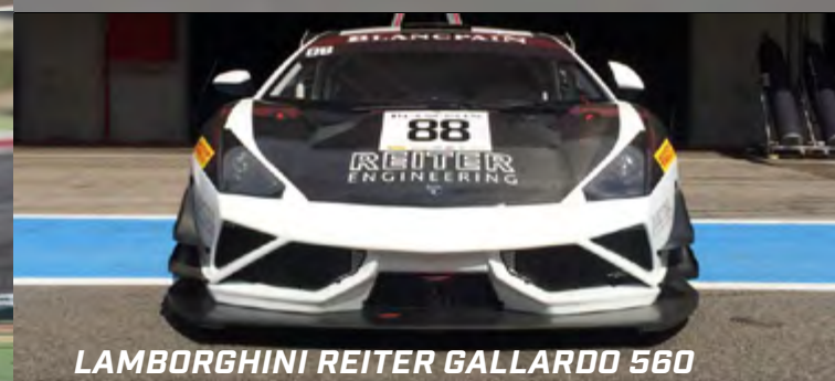
LAMBORGHINI REITER GALLARDO 560