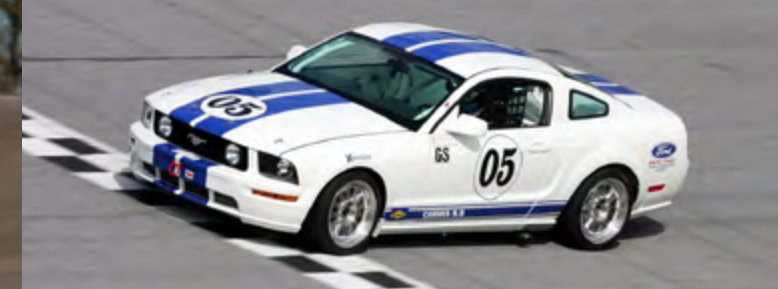
FORD MUSTANG FR500C