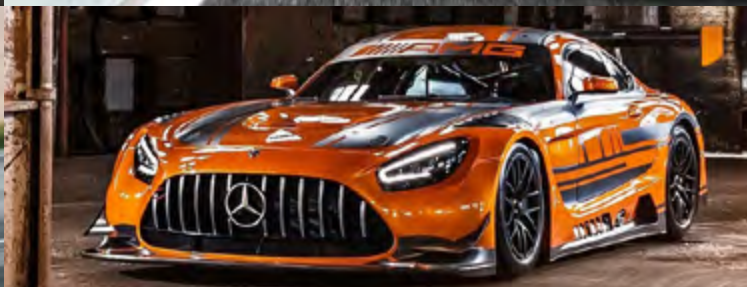
MERCEDES-AMG GT3 2020