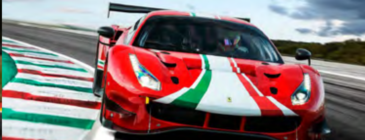
FERRARI 488 GT3 2020