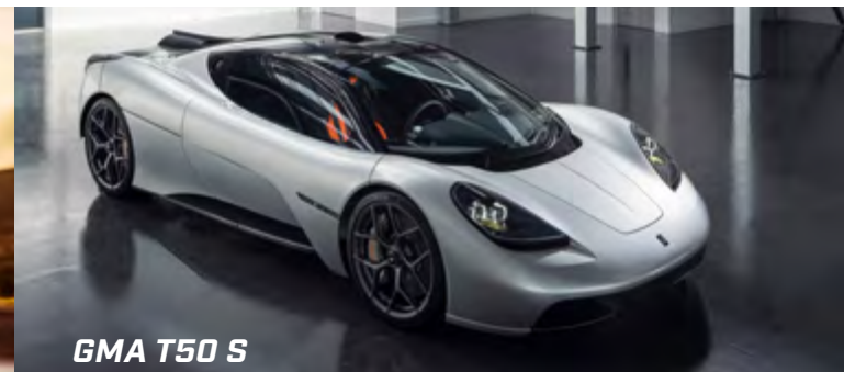
GMA T50 S