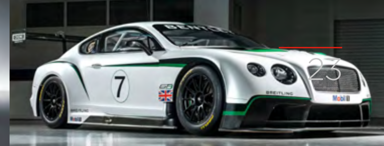
BENTLEY CONTINENTAL GT3