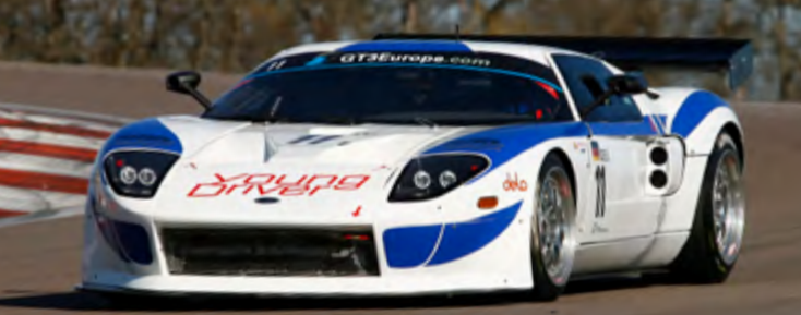
FORD MITECH GT